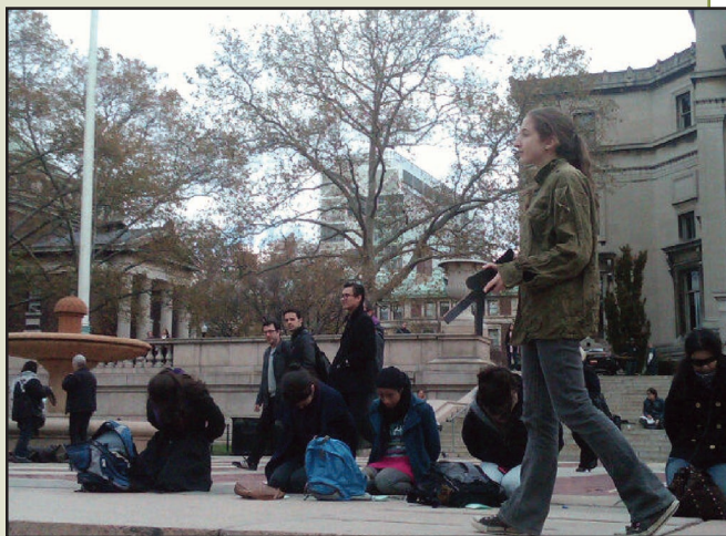
A mock checkpoint at Columbia University.

On both public and private campuses, you may avoid problems by checking your university's policies and getting permission for the event when required. Engaging passersby as part of the checkpoint is likely protected speech. But if such engagement is unwanted, it may be perceived as harassing and discriminatory, and problems may ensue. Leaf-letting passersby to inform them about what you're doing may be less provocative than engaging them in the dramatization. Contact info@palestinelegalsupport.org if you have problems with your mock checkpoint events.