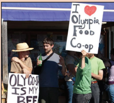
Olympia BDS activists.

CCR and co-counsel won a motion to strike a lawsuit against Board Members of the Olympia Food Co-op after the Board passed a resolution to boycott Israeli products. The court found that the Board members had acted within their duties on an issue of public concern, and that the lawsuit was designed to hamper their free speech rights to engage in a boycott movement of national proportions. The individuals who brought the lawsuit, supported by StandWithUs, were directed to pay attorney fees and penalties for bringing the suit. They have appealed.